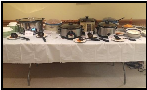
BIG FAMILY: No crock, these pots emptied fast.